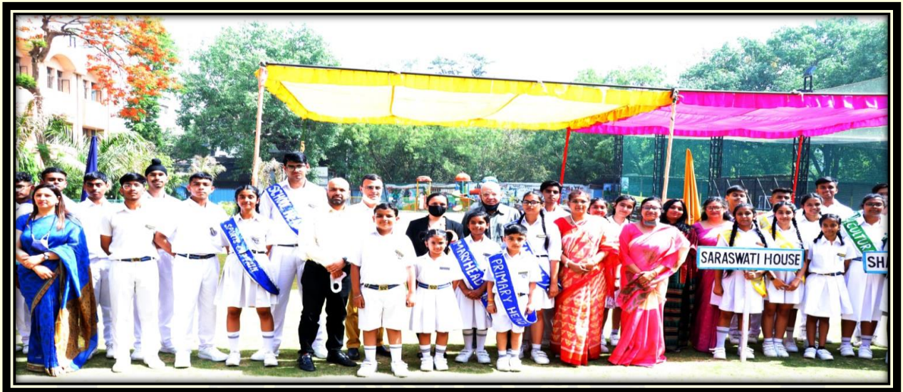
The newly elected leaders of the student council with their mentors - celebrating the proud moments.....