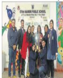
The event gave a platform to students to showcase their talents & creativity through various contests

The event aimed to promote safer driving habits and road discipline thereby reducing casualties and saving precious lives. The panel of judges comprised highly experienced professionals. Participants' impeccable performance impressed them. Indraprastha World School, Paschim Vihar, bagged the Rolling Trophy.