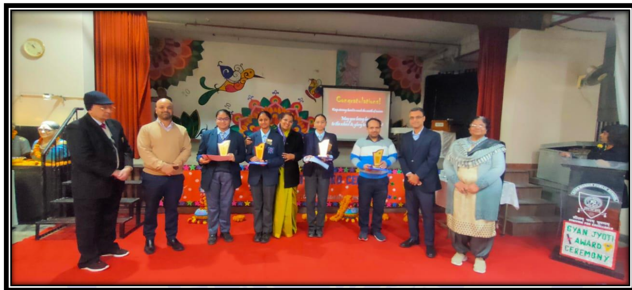
Students received trophies, certificates and stationery materials.