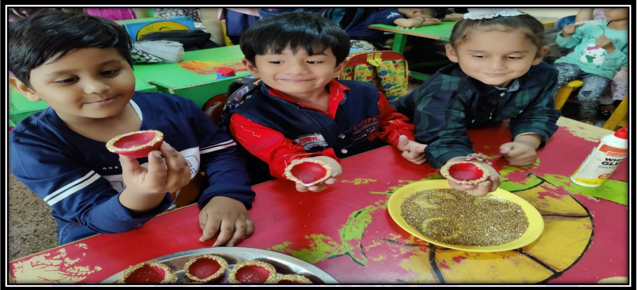
Students with the self made diyas....., admiring their art & calibre .....

Diwali, the festival of awakening..... from darkness to light.....was celebrated in its real sense. The corridors became the testimonials as every nook & corner was decorated with balloons, festoons and other decorative materials. Some students appeared in traditional Indian attire. Children of the Pre-Primary department decorated Diyas while the students of Nursery decorated candles. The students also made paintings based on Diwali. The entire atmosphere echoed with gaiety.