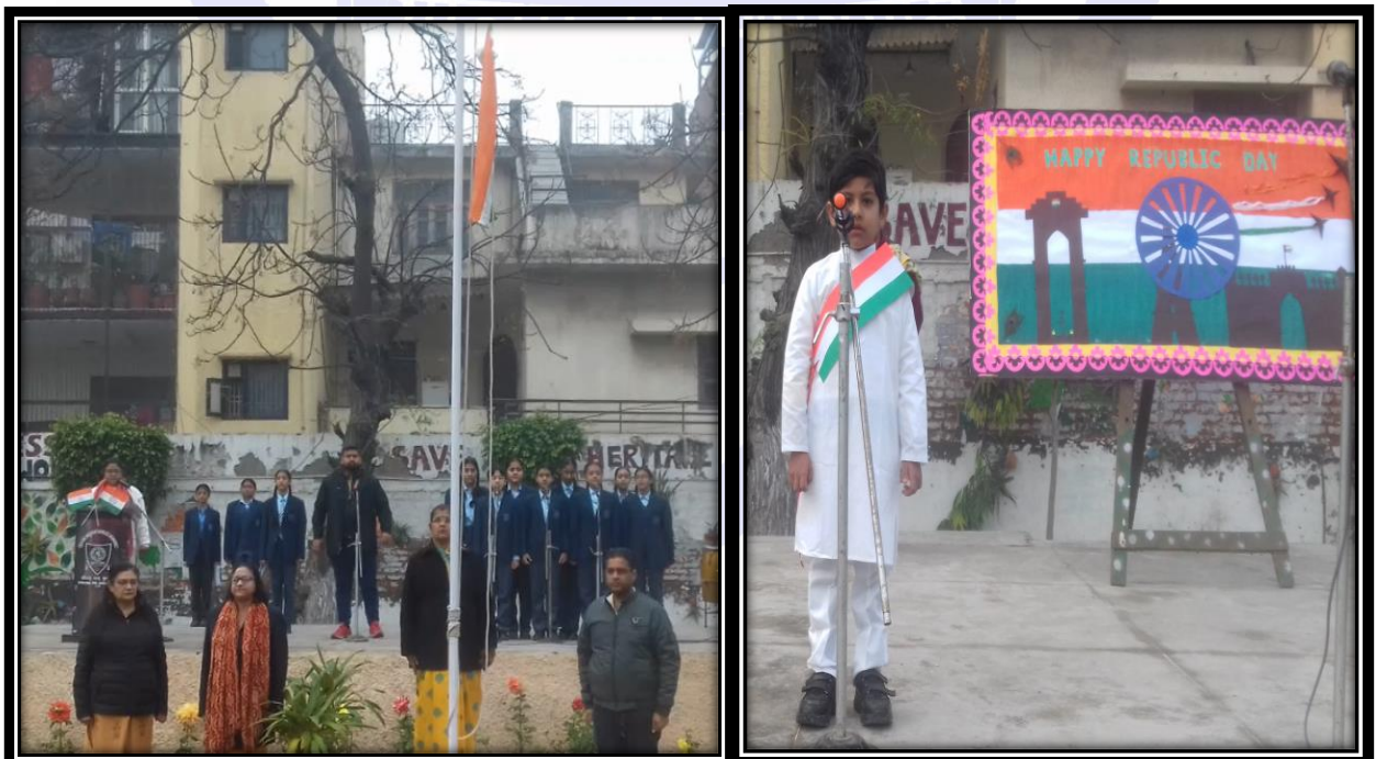
Gyanodians celebrating the festival of the Republic.....

Republic day marks the adoption of India's constitution and the country's transition to a republic on January 26,1950. The school celebrated the day with much patriotic fervour and enthusiasm.