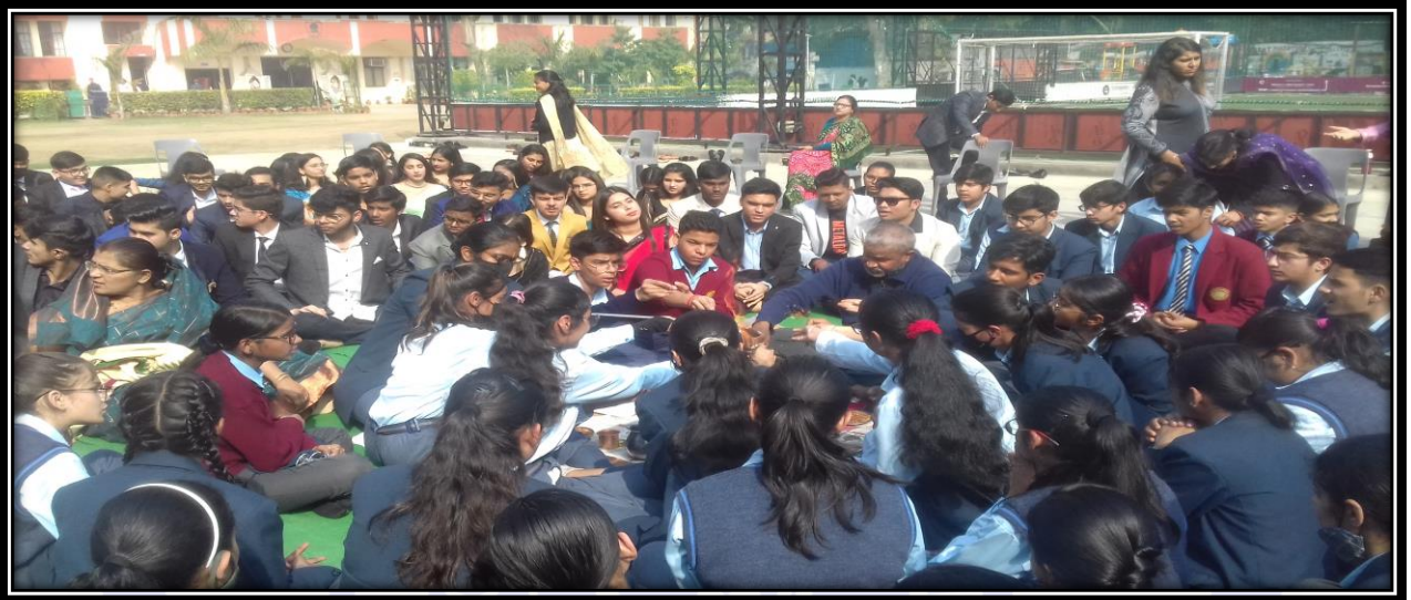
Students of classes X & XII participating in 'Purna Aahuti' for divine blessings.....