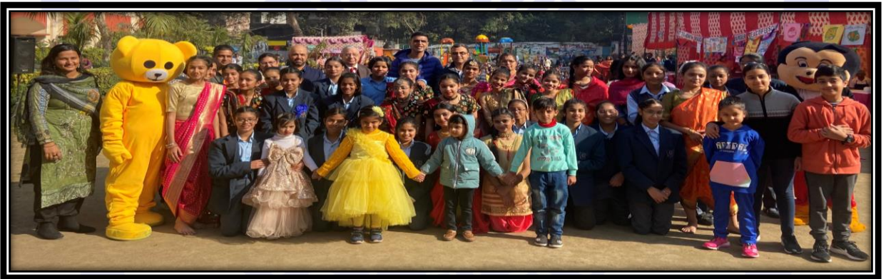
The dazzling dancers of the day.....enthraling the spectators in their own way...