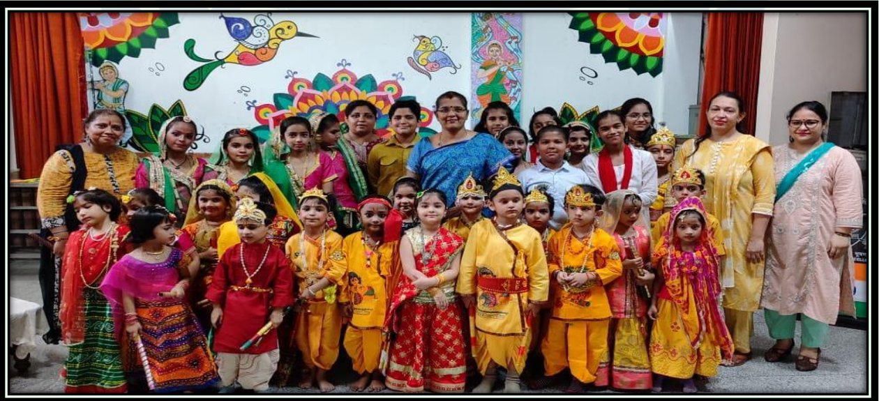
The little Krishnas..... and the Gopis..... of Gyan Mandir.....with their mentors.....

With this sentiment and message the students celebrated the birth anniversary of the preacher of Karma, Lord Krishna. Some of the students dressed up as Lord Krishna and Radha and performed a dance based on the song 'Krishna Murli Bajaye.....' which left everyone mesmerized. Finally, the day came to an end with students leaving with a peacock studded crown on their heads to remind them of the grand celebrations.