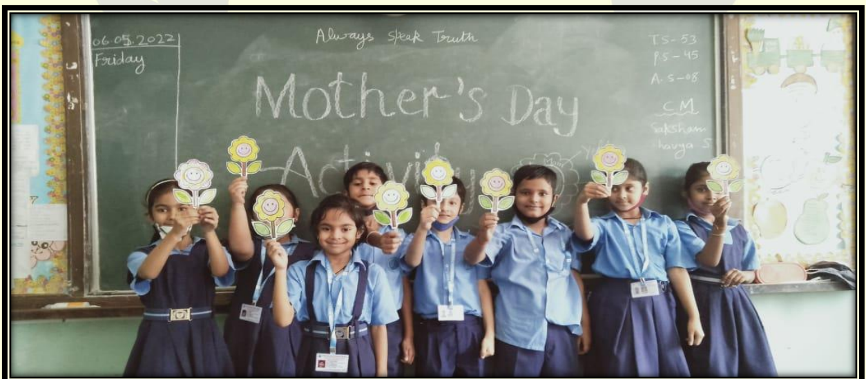
Enthusiastic students with 'Best Mom - Flowers' on sticks.....

'A Mother is one who can take the place of all others, but her place no one else can take'. Mothers have the magic wand to heal all wounds, make the things happen..... and the woes disappear.....' The students celebrated this special day in a very emotional and affectionate manner. They expressed their soft corners for their mothers in a myriad way. Many activities were conducted. Students of Nursery & Prep prepared 'Photo frames', classes I&II crafted - 'Best Mom - Flowers' on sticks, and the others got engaged in making badges based on the topic 'My Mother....My Life...' The students of Middle department got involved in 'Cooking without Fire' activities and prepared a number of health friendly dishes which their mothers relished.