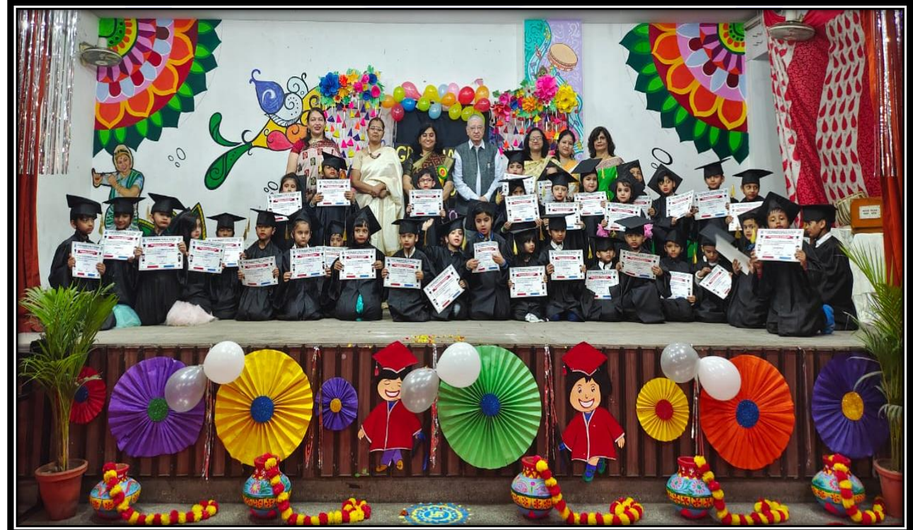
The Little Graduates....so cool.... all prepared to go to Big Kids School....