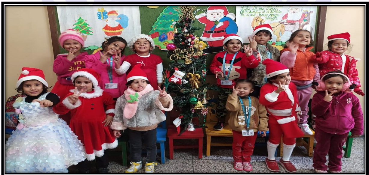
Jingle bells...jingle bells...jingle all the way. Cheerful, bubbling Santas celebrating their day...