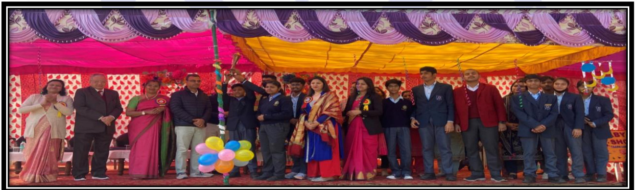
The Jagritians....., the winners of the Cock House, celebrating the day with pride.....

The House System in school provides opportunities to students to develop all aspects of their growth and learning be it personality, morality, creativity, knowledge or skills. To inspire a healthy sense of competition, each student of the school has been allocated one of the four Houses which symbolise school values. Students develop a sense of belongingness and a feeling of unity of being a part of a specific House. Inter House competitions not only give the students a chance to display their talent but also help them learn valuable lessons on teamwork. Be it a debate, quiz, dance or sports events the students give their best to win the 'Best House Trophy'. The coveted 'Best House Trophy' kept the students engaged until the last moment. Jagriti House emerged as the 'Champion House' of the session.