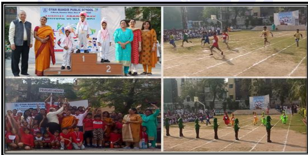
Get...Set...& Go...The Athletes of the four Houses...ready to conquer the game.....

SPORTS DAY 2022-2023 : Participating in school sports provides a welcome break to students and gives them an opportunity to inculcate values and leadership skills in them by providing diverse opportunities that strengthens their character to succeed in all their endeavors ! Students at Gyan Mandir see sports like football, cricket, basketball not just as outdoor games but as an organised way of teaching discipline, importance of hierarchy, teamwork, codes of honour and above all leadership qualities with a true sportsmanship