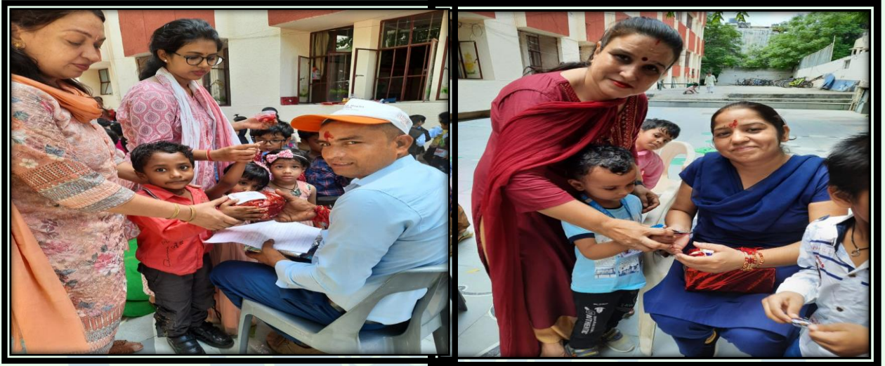
Students tied Rakhis to the supporting staff and thanked them for their support.

Raksha Bandhan Celebration Raksha bandhan, a festival of unique bond of relationship, was celebrated in a superb way this year i.e. by tying Rakhis to our backbone, the supporting staff of the school and thanking them for their support. The kids of the school also visited the nearby MCD school and tied Rakhis to the students and were instrumental in bringing happiness to their faces. The tiny tots presented a spellbinding performance by singing the special 'Raksha Bandhan' song which touched the hearts of everyone present there. It was a mesmerising and joyous experience..... seeing is believing..... for everyone.