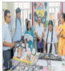
The event showcased the vibrant hues of Indian culture and instilled a sense of belongingness in the students

The parents and the teachers took part in the blood donation camp with zeal. The noble initiative helped in sowing the seed of humanity in the students.